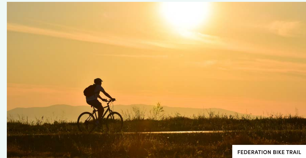
FEDERATION BIKE TRAIL