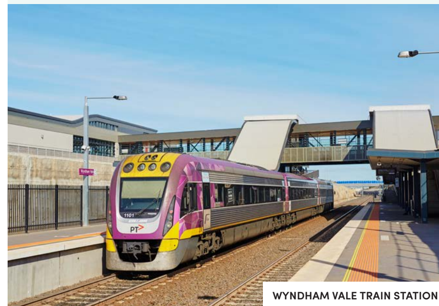
WYNDHAM VALE TRAIN STATION